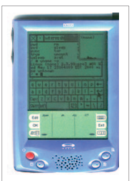
Helio: This is cheap, but has little scope for expansion. Nevertheless the 75MHz CPU is perfectly adequate for MP3 decoding