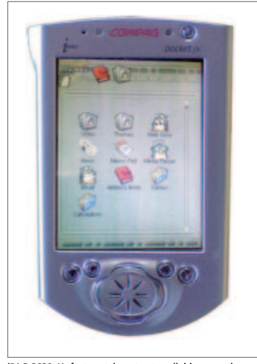
iPAQ 3630: Unfortunately not yet available ex works with Linux, but is a highly promising platform – here with Pocket Linux

VTech may be familiar to you as the manufacturer of children's educational computers. With the Helio, the company is now entering new sales territory. Like the iPAQ, this device is not delivered ex works with Linux, it has to be installed later. Here, too, Pocket Linux is certainly the bestdeveloped approach. At just £150 the Helio is the cheapest Linux-compatible PDA. But the 2Mb Flash will not accommodate too many applications and apart from the RS232 port there are no expansion slots.