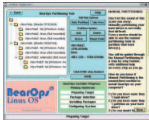
Partitioning the hard disk

Designed to give you everything you need for the home and office and all with a graphical desktop. BearOps Linux has tough rivals to compete with.