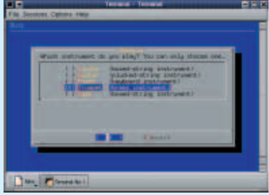
Figure 4: File selection

It shows a file selection dialog, with which one can browse through the filesystem starting from