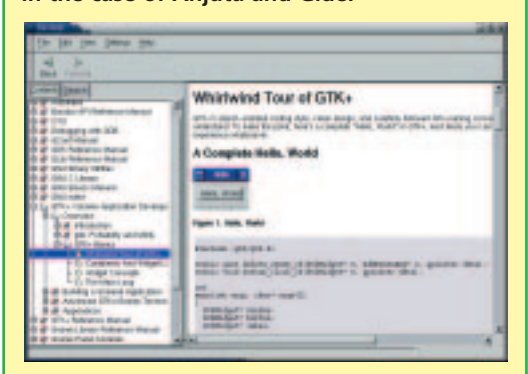
Figure 3: Devhelp can also download documentation from the Internet if required

The fact that every larger Linux library now comes with some documentation of its own is a promising development, but this can also lead to a certain amount of confusion. Devhelp has set itself the task of bringing order to the chaos of the various pieces of documentation. The program manages documentation files in books, for which metadata is stored in so-called spec-files. Thanks to Gnome-vfs, it makes no difference whether the actual content of the books is on your hard drive or on a network, although there are lots of books available for download at the codefactory. Of course it is also possible to search the books, and the search method should be familiar to all Emacs users. Since the target group of Devhelp and IDEs are intended to be roughly the same, it's obviously a good idea to integrate the program into some common IDEs, which should occur in the CVS, at least in the case of Anjuta and Gide.