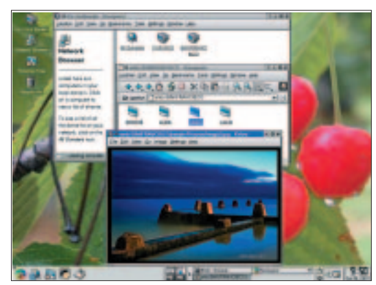
Redmond Linux in action

Caldera Volution Manager is a secure, Web-based, systems management solution that reduces the cost of deploying and managing established versions of Linux and Caldera OpenServer, UnixWare and Open Unix. Volution Manager does so by enabling secure, remote management, monitoring and updating of multiple systems through a browser.