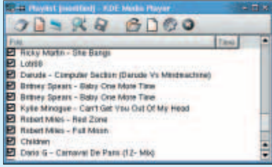
Figure 5: Piece by piece

When you do so, a new item list automatically replaces the old one. At the same time you can display the respective current list in a separate window, if you select the menu item Settings/Display item list (Figure 5). The sequence of the pieces can then be changed very simply using drag and drop.