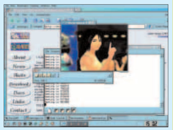
Figure 6: Linux is DivX-capable, too

By entering aviplay filmofyourchoice.avi you can now immediately fire up the film you want. A simple aviplay allows you, as an alternative, to click forwards in a dialogue window, to your favourite video file. Whichever way in you choose, you will always be rewarded with a playback window like the one in Figure 6. If you prefer full screen mode, you can toggle between postage stamp size and full screen at any time with the Esc key.