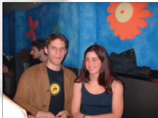
Miguel de Icaza at the party

GNOME 2 was the major topic with numerous libraries presented from the developer's viewpoint, but the conference also provided a platform for technologies such as the GNU PDA Environment that are not directly related to GNOME. Miguel de Icaza also held several talks on Mono, a .NET framework implementation, and was optimistic that GNOME will profit from Mono in the future. Various discussions on the future of GNOME led to plans for easier installation routines and more tightly integrated style guides. The whole event was captured on numerous digital cameras. Sample pictures can be seen at the links below.