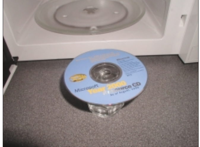
Figure 2: Sacrificed on the Linux Beer Walk Altar