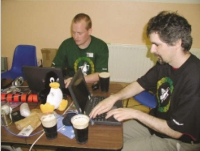
Figure 1: Happy Hacking