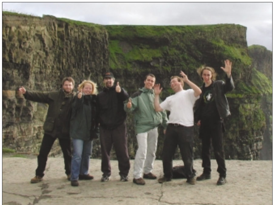
Figure 4: Hacking the Cliffs