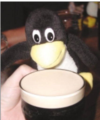
Figure 3: Guinness is good for you