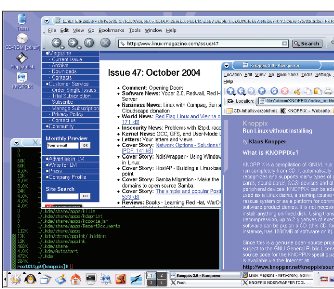
Figure 2: The Knoppix 3.6 Desktop showing Konqueror, Mozilla, and X Terminal.

This month we feature cutting-edge kernels from the 2.6.8 series. We also include the 2.6.9-rc1 release candidate development release. This month' Kernelware is in the /Kernels 2.6 directory: